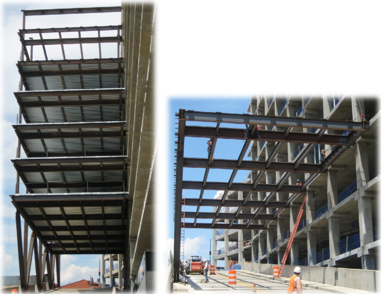
Figure 1 & 2: the M Street Ramp Steel Structure